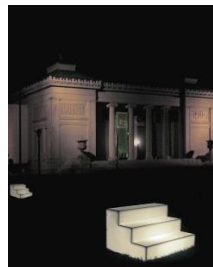
Dawn DeDeaux "Steps Home," 2010